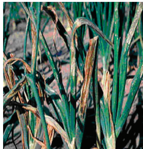
Figure 3: Xanthomonas leaf blight symptoms of onion; noted water-soaked lesions.

Plant seed, transplants and sets free of X. axonopodis pv. allii . Practice a two-year or longer rotation to a nonsusceptible host such as winter wheat or corn. Avoid close rotations of onion and garlic with