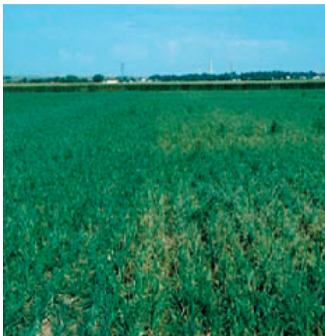
Figure 1: Xanthomonas leaf blight infection of susceptible yellow onion variety (right side); resistant white onion variety on left.