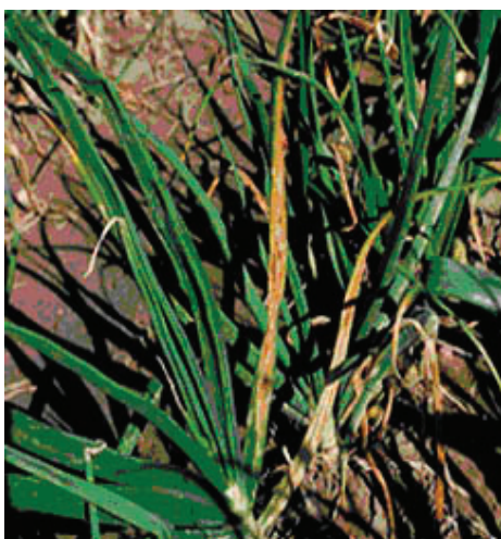
Figure 2: Xanthomonas leaf blight symptoms on older leaves of an infected onion plant.

Frequent rains after bulb initiation, especially when driven by strong winds, favor severe disease epidemics. Overhead irrigation and humid, overcast conditions also appear to favor the disease. Distinct disease foci can develop and lead to secondary spread of the pathogen when as little as 0.04 percent of seed is contaminated with the bacterium if abundant overhead irrigation is supplied to the crop. Frequent rains or overhead irrigation appear essential for seed contaminated with X. axonopodis pv. allii to produce an epidemic of Xanthomonas leaf blight in semi-arid environments.