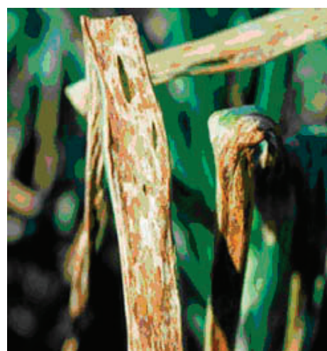
Figure 4: Xanthomonas leaf blight symptoms of onion; note water-soaked flecks and lesion discoloration.

leguminous crops such as dry bean, soybean, or alfalfa. Varieties with complete resistance to Xanthomonas leaf blight are not commercially available, but varieties vary quantitatively in their reaction to the disease. Tolerant and moderately resistant varieties include white and red market class varieties such as 'Cometa', 'Blanco Duro' and 'Redwing'. Yellow varieties such as 'X-202', 'Cannonball' and 'Vantage' are most susceptible.